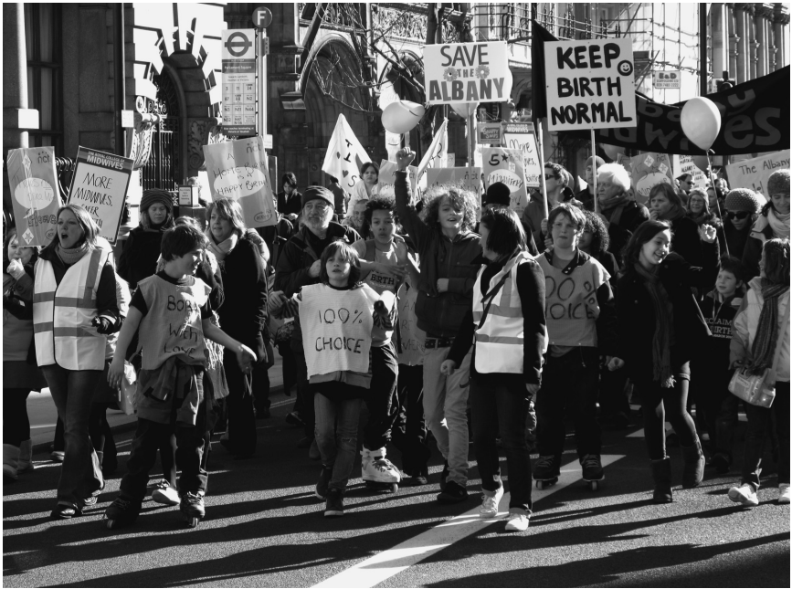
Figure 17.1 Reclaiming Birth March, London 2009

has now engaged national and international support for the wider issues of change: particularly one-to-one care from known and trusted midwives, more midwives, and more birth centres and home births. A rally in March 2010 to highlight these calls was supported by the Royal College of Midwives, the National Childbirth Trust, the Association for Improvements in the Maternity Services, the Association of Radical Midwives, Independent Midwives UK, Albany mums and the Albany Action Group. It is this sort of collective, cohesive action that might impact on maternity services.